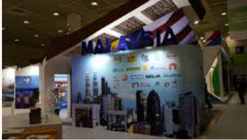
Views of the Malaysian Pavilion