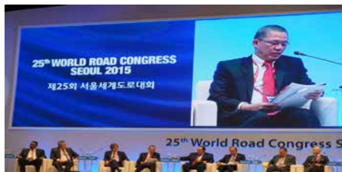
The Minister of Works Malaysia Dato' Sri Haji Fadillah bin Haji Yusof at the 25th World Road Congress Ministerial Session

REAM also organised a 2-night 3-day post congress study tour to Busan beginning 6 November.