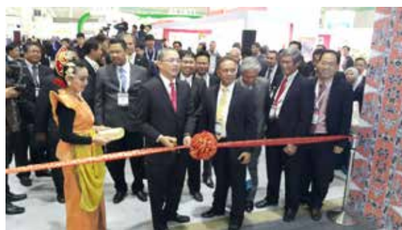
The Official opening of the Malaysian Pavilion by the Minister of Works, Malaysia