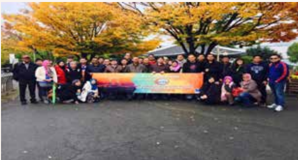
Some of the Malaysian delegates during the study tour to Busan