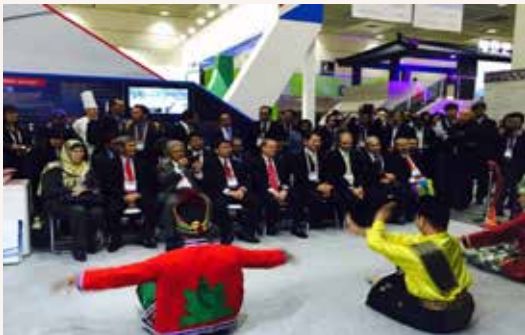
The Malaysian cultural performance, following the official opening ceremony